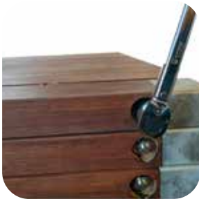
Modular spine rod