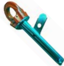
Dedicated lifting device