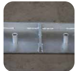
2 way matting edge steel connector