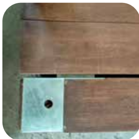
Steel to Steel connectors