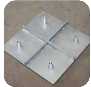
4 way connector