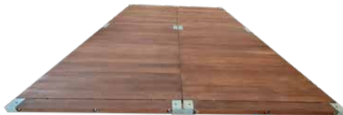
4 connected ECM-70 units – 21 square meters