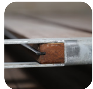
Integral beam locking rib