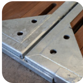
4 connector screws per mat