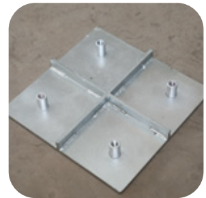
4 way connector