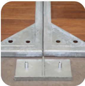
2 way matting edge steel connector