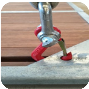
Dedicated lifting point