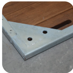
Reinforced corner gusset with side pocket repair access