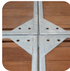
4 way central connector 4 screws per mat